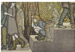
junction , 2025, Oil-based woodblock print on washi paper

Through progressive carving and layering, the woodblock transforms, and the same image cannot be printed after completion. This irreversibility resonates with her themes. The figures in her work do not tell dramatic stories; within a gentle visual language, they open a space where each viewer weaves their own narrative.