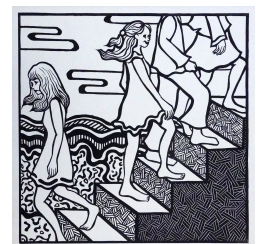
Kafka's Staircase No.4 , 2023, Oil-based woodblock print on washi paper, Edition: 1/1