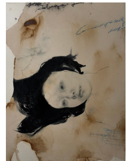
Return Everything, Shadow and All , 2025, Cotton cloth, art glue, mineral pigments (Suihi-enogu), ink, pencil, and watercolor pencil on wooden panel, 715 x 542 mm (28.1 x 21.3 inches)