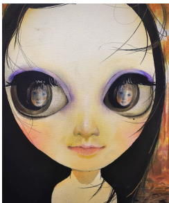
Whispered Conspiracy , 2025, Cotton cloth, art glue, ink, and watercolor pencil on wooden panel, 375 x 315 mm (14.8 x 12.4 inches)

Ishiguro Hikaru's work traces the space between presence and absence, beginning from an experience of loss. Butterflies, moths, and seashells appear as signs of transience and return, while floating faces drift between memory and the unconscious. What emerges is not a narrative, but a condition—an opening through which viewers encounter their own sense of impermanence.