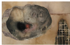
Utsuse no Himitsu ha Watashi nomi zo Shiru , 2024, Cotton cloth, mineral pigments (Iwa-enogu), powdered pigments (Suihi-enogu), ink, oil varnish, cement, gold leaf, 2500 x 4000 mm (98.4 x 157.5 inches)