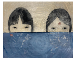
Cipher , 2024, Canvas, pencil, animal glue, mineral pigments (Iwa-enogu), and sand on wooden panel, 466 x 527 mm (18.3 x 20.7 inches)